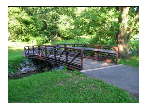
Carroll Creek Elevated Footpath