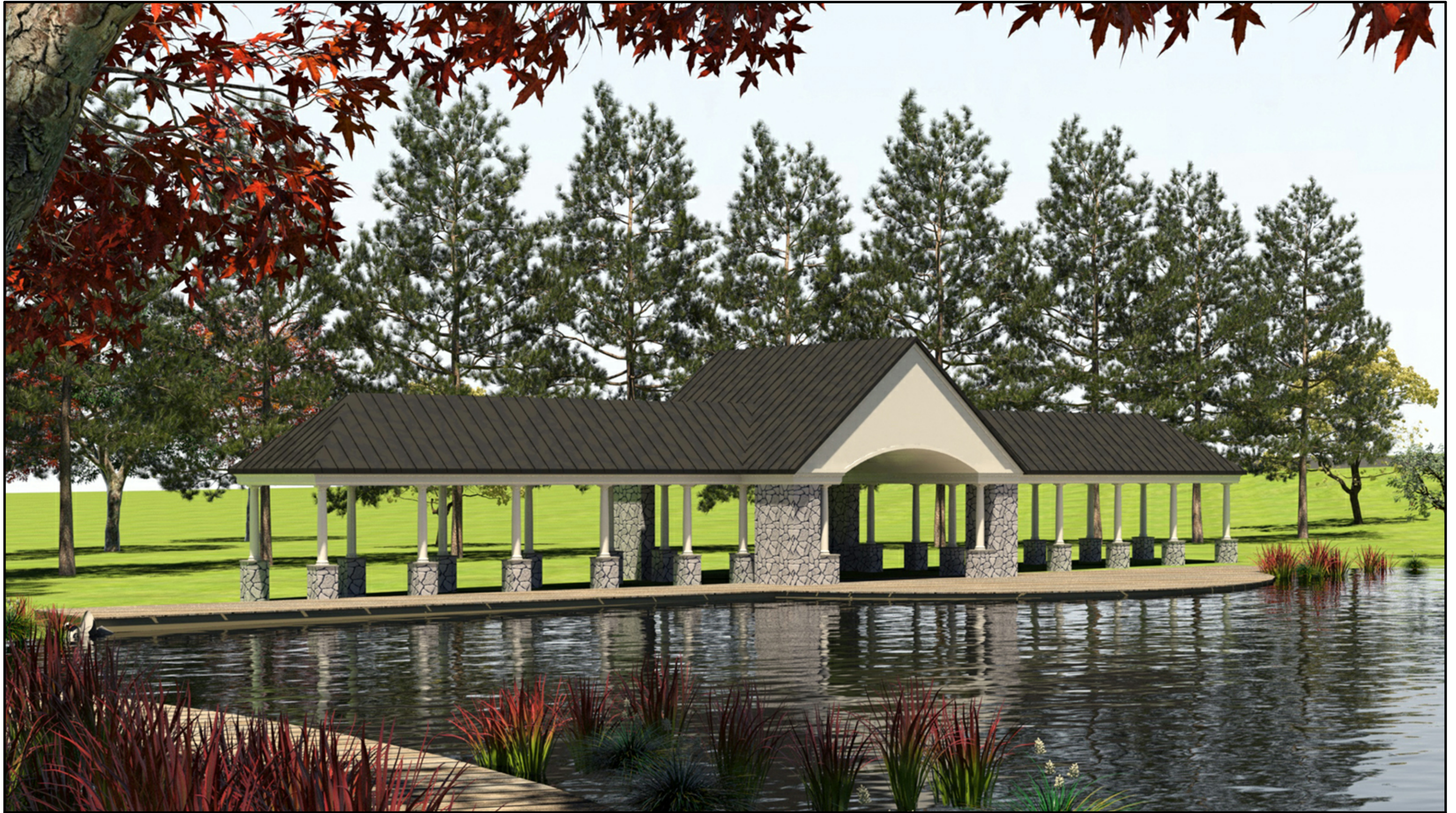
SHELTER SCHEME G - ARTISTIC RENDERING Culler Lake