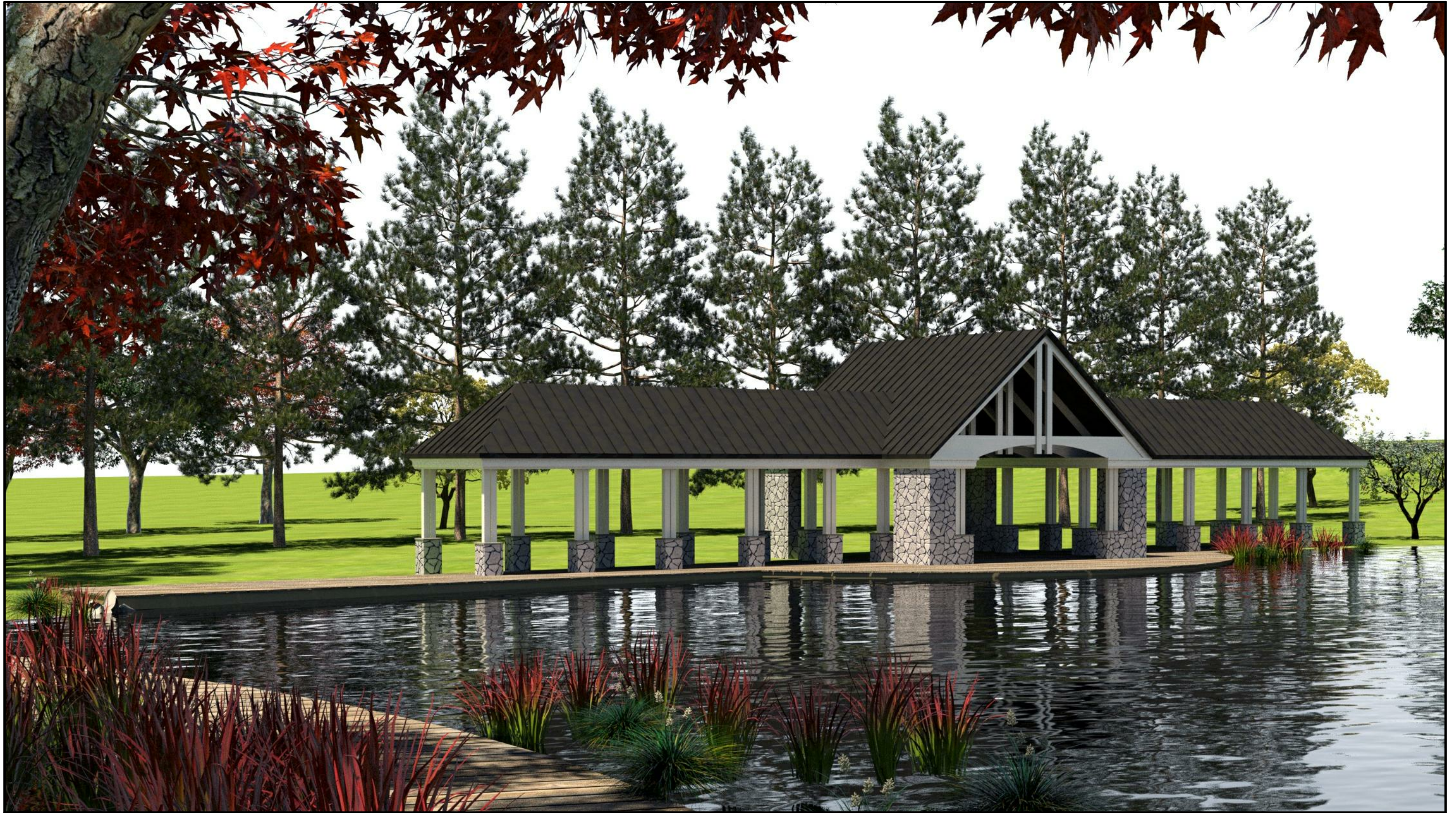
SHELTER SCHEME I - ARTISTIC RENDERING Culler Lake